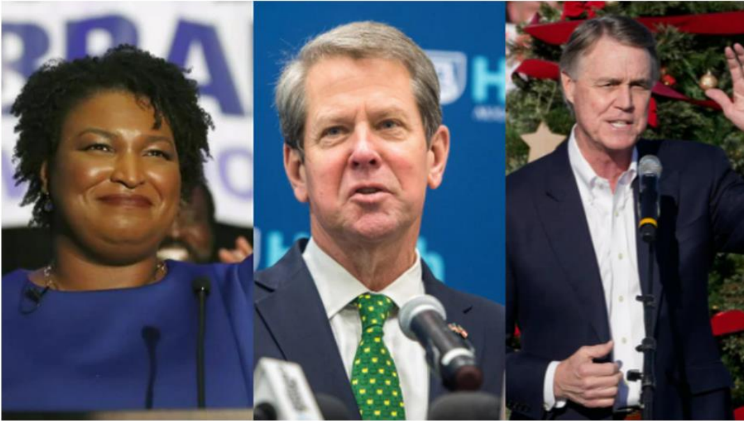
Abrams, Perdue governor Stacey Abrams (L) and former Sen. David Perdue (R) have entered the race for Georgia governor to run against Gov. Brian Kemp (center)